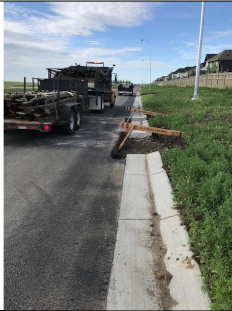
Figure 7: Unloading forms from truck bed, and forms placed in hole for use