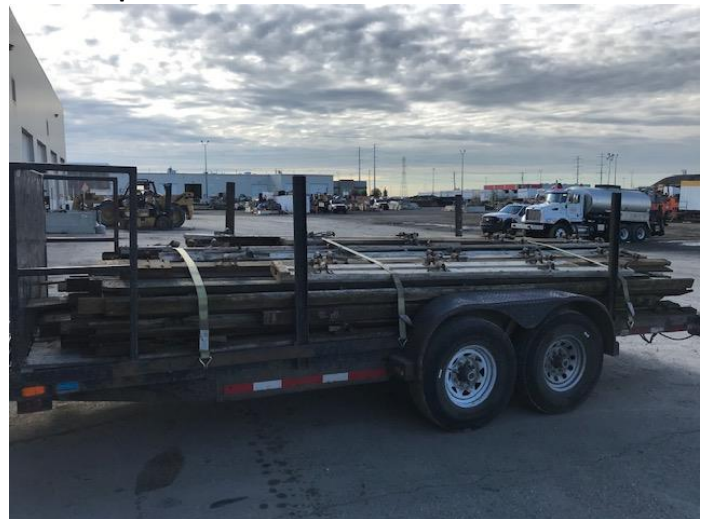
Figure 4: Truck trailer loaded with forms, and secured with straps