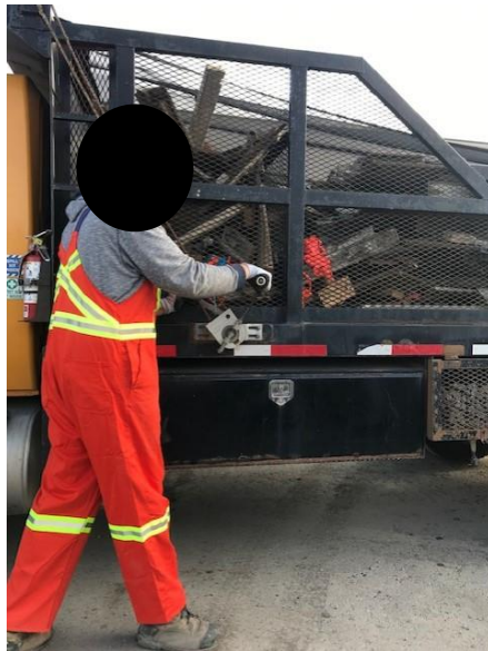
Figure 3: Use of hand crank to cover or remove tarp from truck bed.