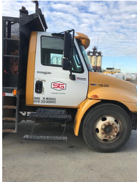
Figure 1: Cab of Form Truck