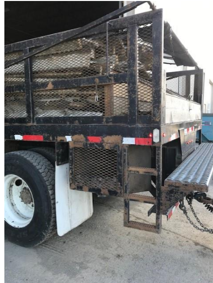
Figure 2: Access to truck bed via ladder, or step