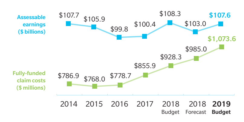
Fully-funded claim costs vs assessable earnings

Changes in individual employer rates continue to reflect rate group and employer performance.